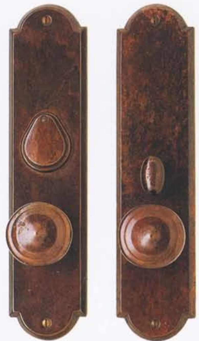
Bronze arched handle and lock set ($1,131), www.rockymountainhardware.com